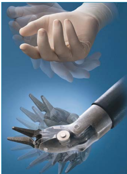
The robotic arms of the da Vinci system are uniquely designed to mimic the movement of the human wrist.

Size of high-definition, video monitor: 19"