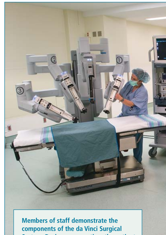
Members of staff demonstrate the components of the da Vinci Surgical System. During an operation, the patient lies on the surgical table (left), and robotic arms, each equipped with a tiny surgical tool, extend into the patient's body. The operation is performed by a surgeon at a special console (right) connected to the robot. Surgery is monitored by electronic equipment on a separate cart (centre). During an operation, the robot and its arms—but not the surgeon's console—are covered in sterile plastic sheeting.

That doesn't mean da Vinci will be used in every instance from now on. Dr. Rosenberg notes that conventional surgery still makes more sense for relatively simple procedures such as removal of the appendix, while standard laparoscopic surgery is fine for operating on the gall bladder. “Surgeons around the world are comparing notes, and we know that several procedures, such as removal of the prostate, are ideal for the