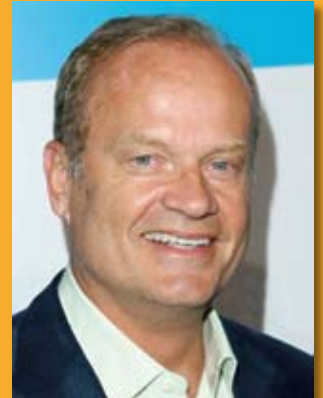
Dr. Frasier Crane

On April Fool's day, the Department of Public Affairs and Communications will launch a new web page on JGH.ca, featuring podcasts by radio personality Dr. Frasier Crane , a staff physician in the JGH Department of Psychiatry. Just e-mail your questions to Dr. Crane and then listen for his answers online.