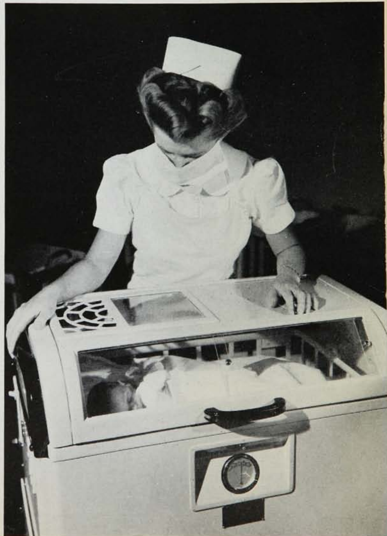
● A prematurely born infant being given its chance for survival in the newest of air-conditioned incubators.

The situation with regard to nursing requires particular mention. Our Hospital operating, as it does, with a staff made up entirely of graduate nurses, has found greater difficulty than Hospitals operating Training Schools for Nurses. There is a distinct shortage of graduate nurses resulting from the following causes: the institution of the 8-hour day for special duty nurses; the enlistment of a considerable number in the Armed Forces; the employment of many in defense and other industries and the higher degree of Hospital utilization. Salary increases