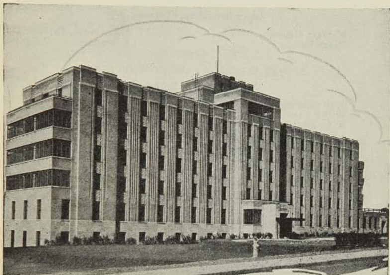
OUR "TRIBUTE EVERLASTING"